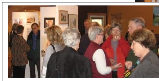
Taking It In