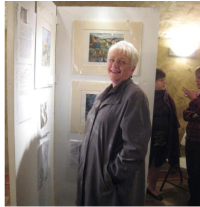
Checking it Out