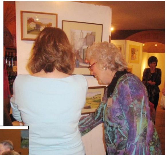
It's ALL about the Art