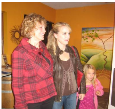
It's A Family Affair