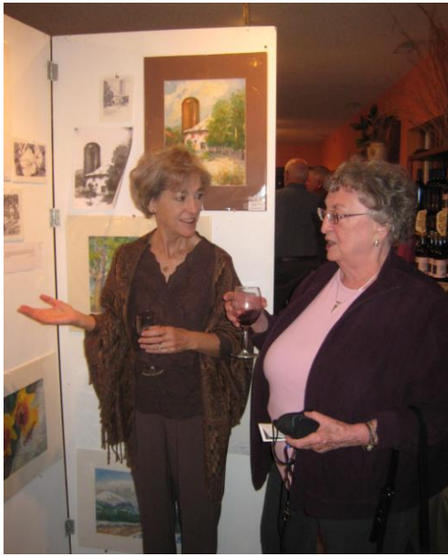
Wine and Watercolor – Wonder!